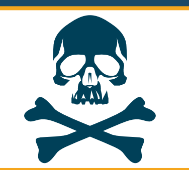
Mixing prescription painkillers with alcohol can slow heart rate and respiration, leading to death.

Prescription painkillers for sport related injuries can still be dangerous and addictive.