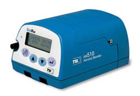
TSI SIDEPAK AM510 PERSONAL AEROSOL MONITOR

A minimum of 30 minutes was spent in each venue. The number of people inside the venue and the number of burning cigarettes were recorded every 15 minutes during sampling. These observations were averaged over the time inside the venue to determine the average number of people on the premises and the average number of burning cigarettes. Room dimensions were also determined using a combination of any or all of the following techniques; a sonic measuring device, counting of construction materials of a known size such as floor