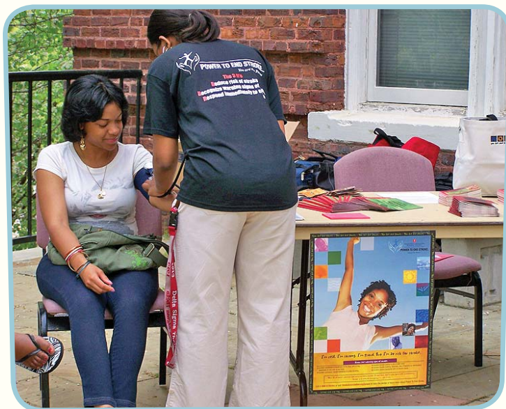
Nursing students volunteered to take blood pressures.

The campaign recruited ambassadors from fraternities at Tuskegee University and from both fraternities and sororities at Alabama State University, beginning with a Train the Trainer: Power To End Stroke program. During an initial presentation participants were provided a toolkit of materials to educate the ambassadors about stroke. In turn, these ambassadors trained other ambassadors.