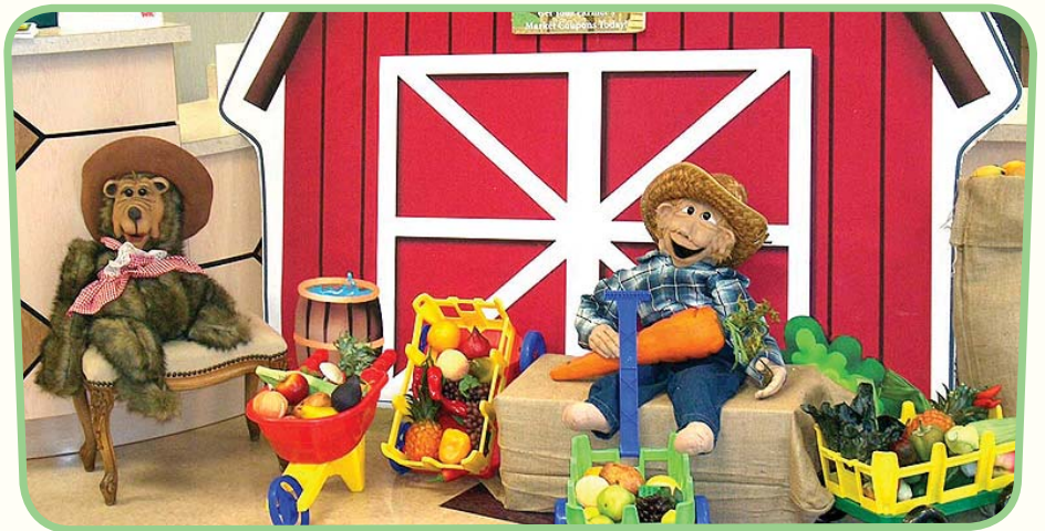
Children entering the Madison County Health Department enjoyed the "barnyard" display employees created and seeing WIC staff dressed in farm clothing.