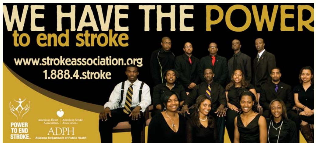
This billboard depicted sorority and fraternity members from Alabama State University.