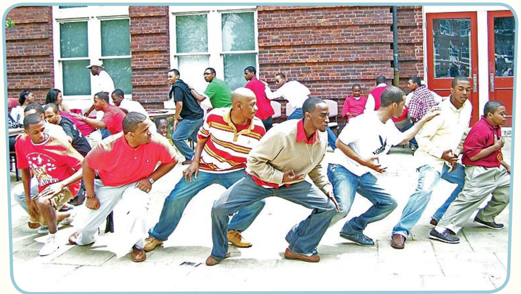
Smooth moves are demonstrated at Tuskegee University.

For more information contact the Cardiovascular Health Branch, Bureau of Health Promotion and Chronic Disease, (334) 206-7063 or visit www.adph.org/cvh .