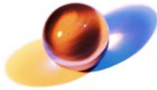
24 hours old