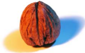
3 days old